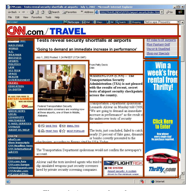
Figure 1: An example web page

document and displayed on a small screen PDA, showing a very concise, yet logically sound representation of the original document.